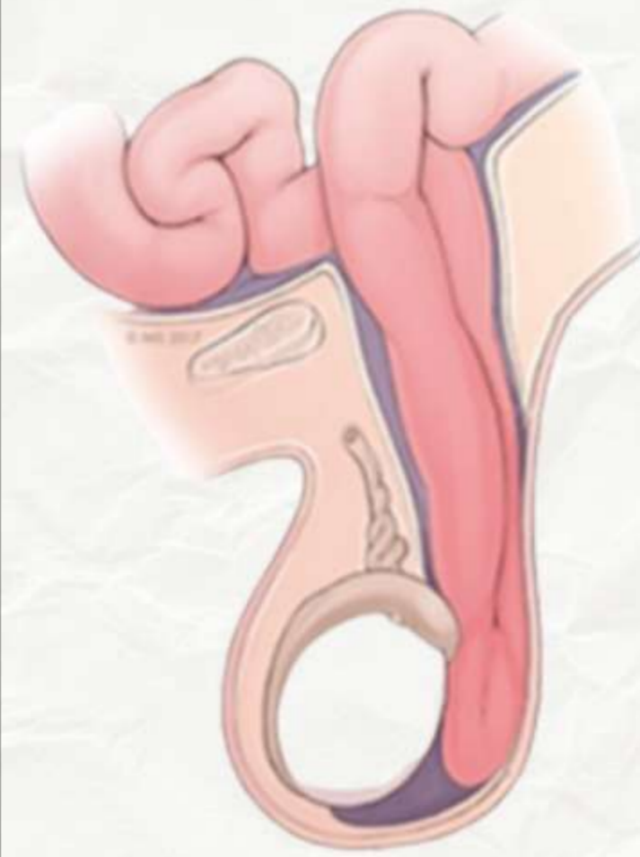
Inguinal hernia into scrotum